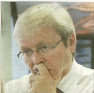
ON THE RADAR: Prime Minister Kevin Rudd in the city yesterday.